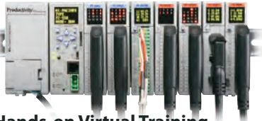
Productivity PLC Live Hands-on Virtual Training