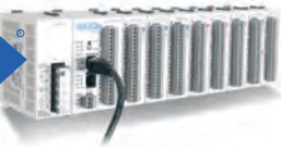
CLICK PLC Live Hands-on Virtual Training