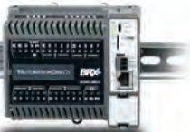
Do-More BRX PLC Live Hands-on Virtual Training