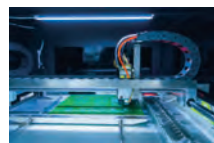
Motion Control - Live Hands-on Virtual Training