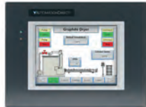
C-More HMI Live Hands-on Virtual Training